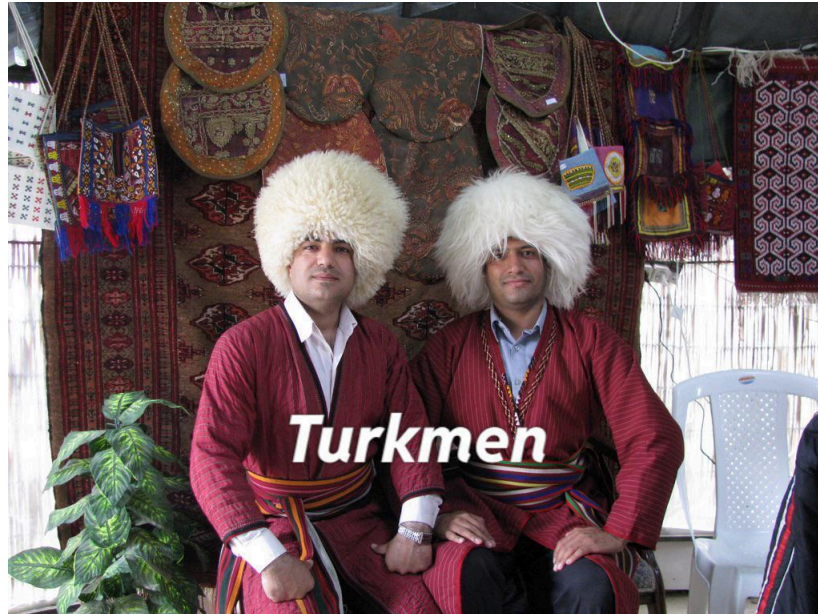
FIGURE 3. Turkmen wearing Astrakhan fur hats.