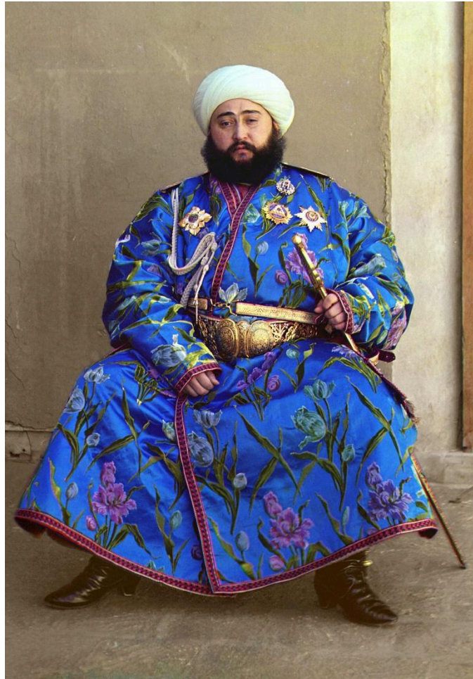
FIGURE 2. The Emir of Bukhara (Western Uzbekistan) wearing a chapan in 1911.