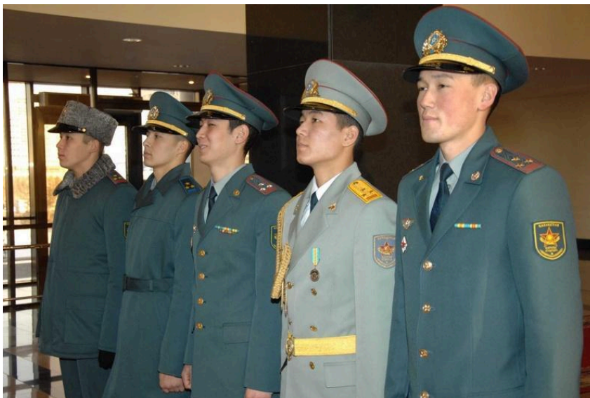
FIGURE 7. New, “Europeanized” Kazakh parade and dress uniforms with a “Eurasian character” in 2011.

By and large, only Kazakhstan made major efforts to break with the Soviet legacy regarding military attire. Many elements of Kazakhstan’s uniforms reflect the European or Western orientation of the country, as opposed to belonging to the Russian or Chinese spheres of influence. Such measures include introducing the “KZ” insignia in Latin letters, replacing sewed-on Soviet Russian-style shoulder blades with so-called swinging shoulder blades decked with Kazakh folk motifs, or reducing the diameter of peaked caps. Among the new regulations of 2006, sidecaps were replaced by NATO-style berets in the combat dress. In 2011, a Kazakh designer, Kuralaj Nurkadilova, was hired to make plans for a modern, but at the same time traditional, line of Kazakh uniform attire (CSM 2011b). Most recently a Presidential Decree signed on December 12, 2023, regulated military attire in Kazakhstan, with regards to the Air Force.