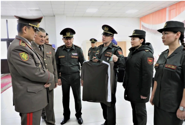
FIGURE 6. Presentation of new Kyrgyz service dress uniform in 2021.

Kyrgyzstan did make a stride towards creating a more characteristic uniform by way of Presidential Decree No. 311, issued on August 11, 2005. Chevrons and national insignia on the peaked cap were revised. Most recently, Presidential Decree No. 148, issued on May 11, 2022, made changes to the service dress uniforms worn by Kyrgyz forces. Some remarkable modifications include the indication of blood types on shirts. Some critics, however, highlight the new uniforms’ great similarity with the Russian Army’s service dress uniform, and even point to reverse trends in Kyrgyz design.