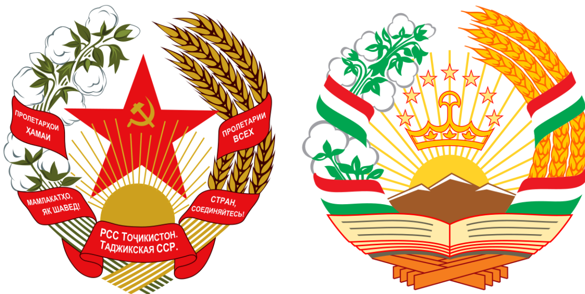
National emblems of Tajikistan.

The lack of change in mentality, the strong military and economic ties to Russia, and the shortage of raw materials or limited industrial capacity—all point to increased leeway for countries pursuing a trend toward national style changes in dress regulations and formalities.