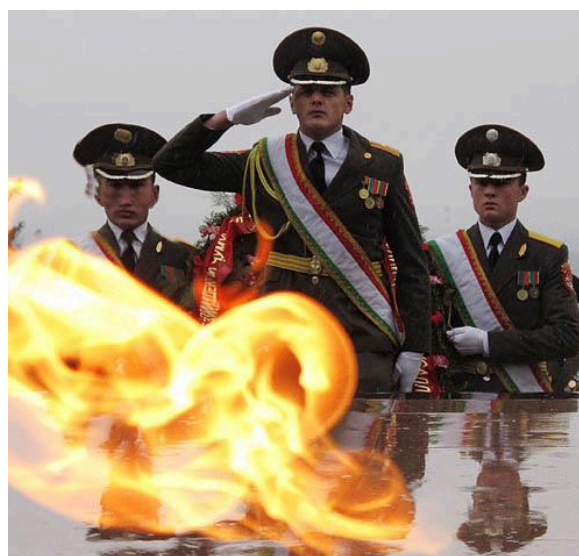
FIGURE 4. Tajik honor guard in 2011: in terms of uniforms, not much has changed since Soviet times.

This strong Russian orientation is reflected in uniforms as well. The standard code for Central Asian parade and dress uniforms is the 1994 Dress Regulations of the Russian Army, which carry on the traditions of the tsarist and Soviet eras, albeit slightly influenced by contemporary Western trends (CSM 2011b). While Kazakhstan and Kyrgyzstan have not done so, the other three states of the region have adopted this Dress Regulation at some point over the past 30 years. One of the main reasons for this is that oftentimes Russian materiel was still used to tailor uniforms, as the spectacular cases of Turkmenistan and Kazakhstan show: the former was compensated by Russia with dress materiel (CSM 2011a), while the latter had to appeal to Russia for uniforms due to the lack of textile factories in the country at that time (Olcott 1996, p. 74). Tajikistan's affiliation is easily understandable, as Russian troops helped the local regime to stabilize its power during the civil war of 1992 to 1997.