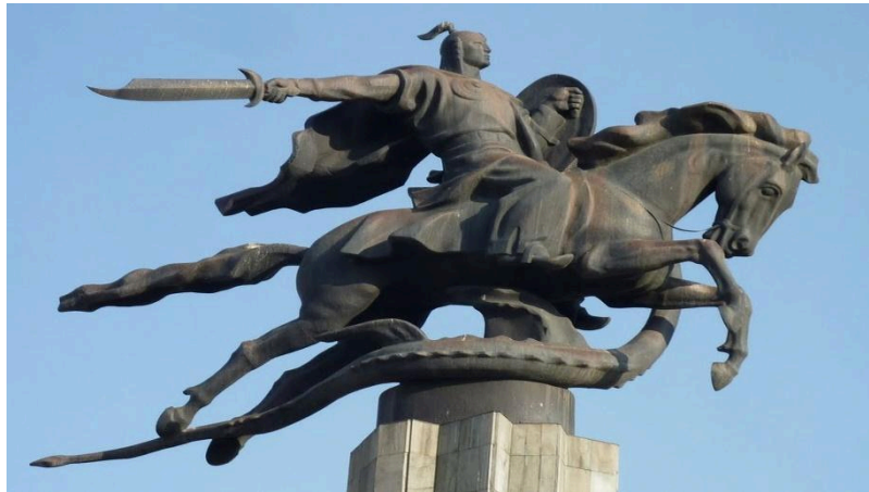
FIGURE 1. Equestrian statue of Manas in Bishkek, Kyrgyzstan.